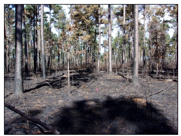
Mid-rotation loblolly pine plantation, Angelina County, 670 acres