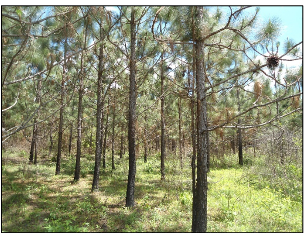
Longleaf pine plantation, Angelina County, 23 acres