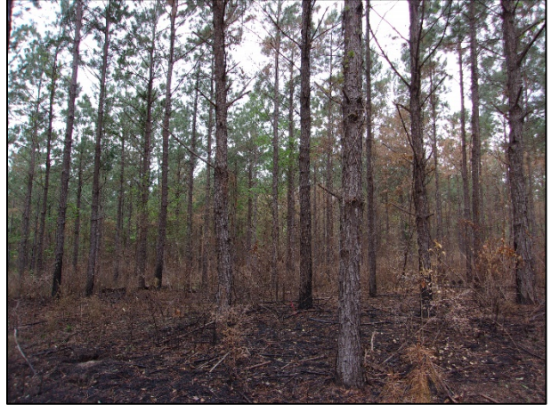
Loblolly pine plantation burned following first thinning, San Augustine County, 270 acres